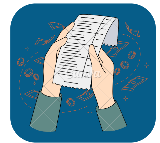
Expenses for non-academic in school, co-curricular, or extracurricular activities