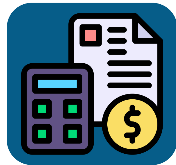
Overhead *Cost of doing business that is not the direct instruction of students (office staff, office equipment, printers)