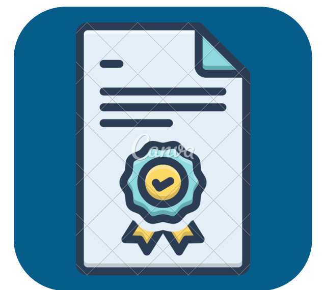
Costs related to district or school administration, including accreditation