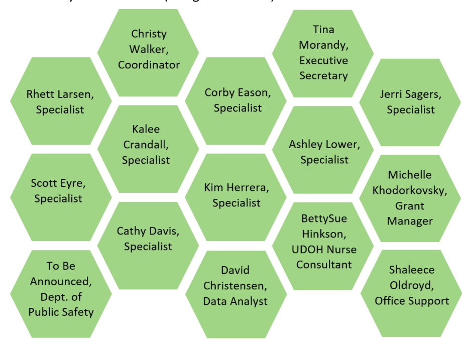
Figure 1. Safe and Healthy Schools Team

The Utah State Board of Education, in coordination with all stakeholders, has made Safe and Healthy Schools a board priority. It is one of the four goals of the Board's strategic plan. To this end, the Board has created the Safe and Healthy Schools Team which is depicted in the figure below. One foundational step toward the development of the student support team pilot program is ensuring that key personnel are in place including the Safe and Healthy Schools Team (in Figure 1 below).