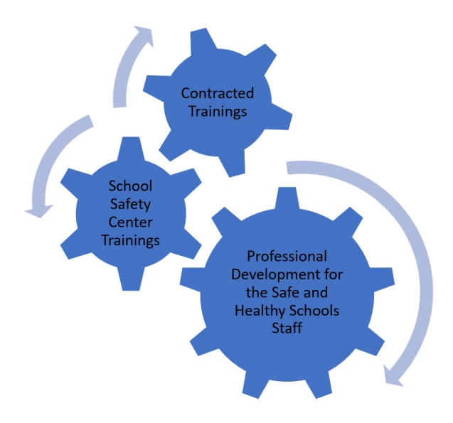
Figure 3. Development of Support Team Structures

Thus far, the contracted trainings included a one-day workshop on Comprehensive School Threat Assessment Guidelines (C-STAG) offered at the end of October 2019. This workshop covered the rationale for threat assessment, how the team functions, what steps to follow in conducting an assessment and resolving transient and substantive threats. In early November 2019, the Board offered a SIGMA Threat Management Training. SIGMA is a partnership of experts in behavioral threat assessment, threat management, and violence prevention. This training included how to build and operate multi-disciplinary teams, helping LEAs develop their own ability to assess and manage threatening situations in accordance with best practices.