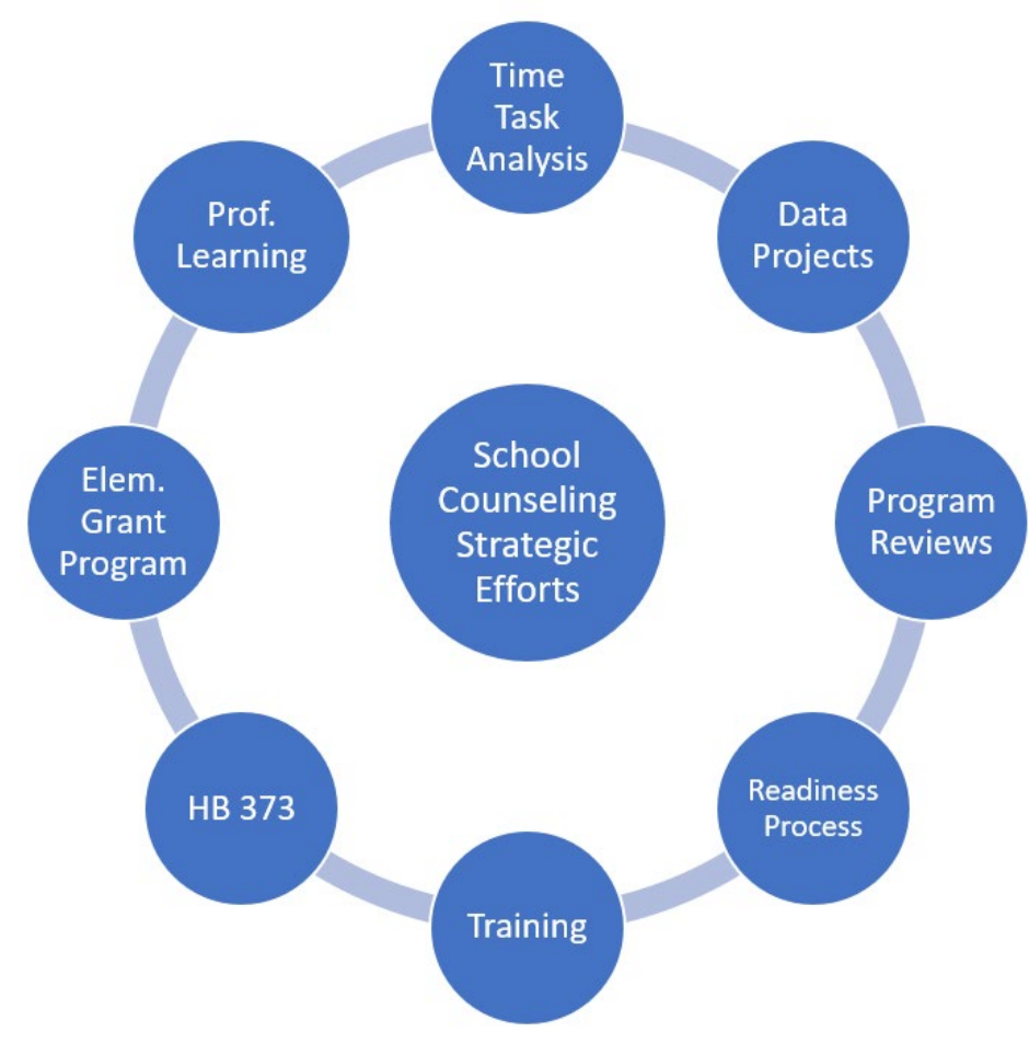
Figure 1. Categories of Strategic Efforts around School Counseling Services