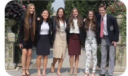
Utah DECA State Officer Team