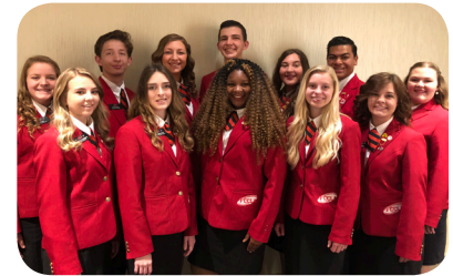
Utah FCCLA State Officer Team