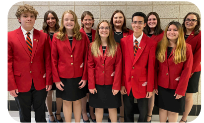
Utah FCCLA State Officer Team